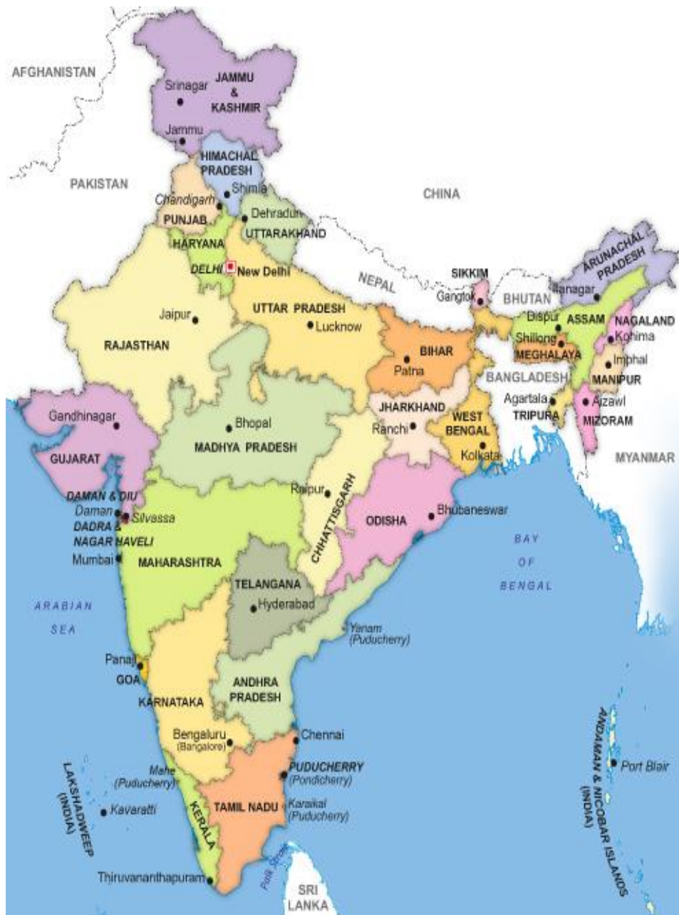
Map 4.1 Map of India showing its States and Union Territories