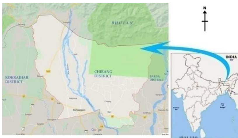
Figure 5.1 (map) Satellite map of Chirang District

This historical flash floods alarming Aie river have shown that structural flood control measure are required to protect natural resources, agriculture land and villages from flood risk and land erosion.