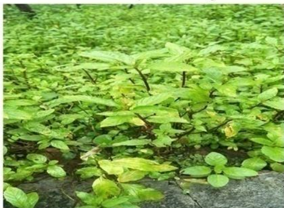
Photo No.33- Podina