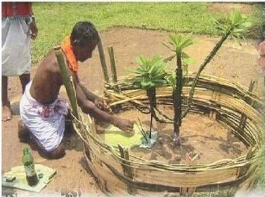
Photo No.1- Bathou Bounai