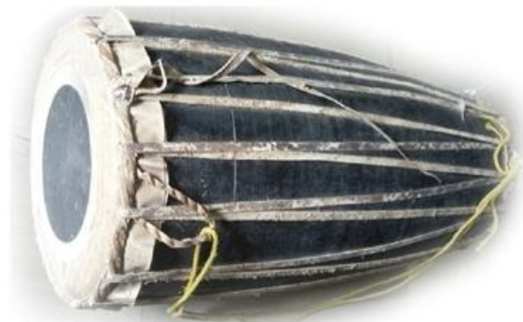
Photo No.6- Kham