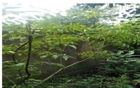
Photo No.38- Neem