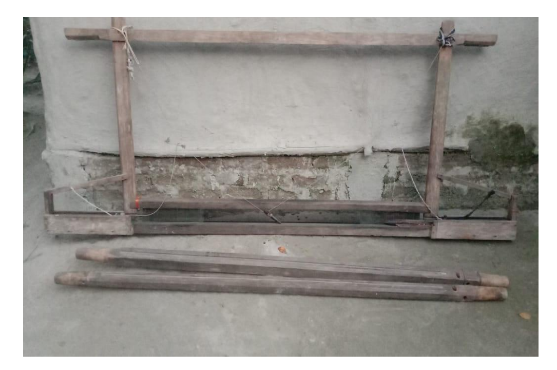
That (Sal), Gandwi, Rasw, Makhu (looming utensil)