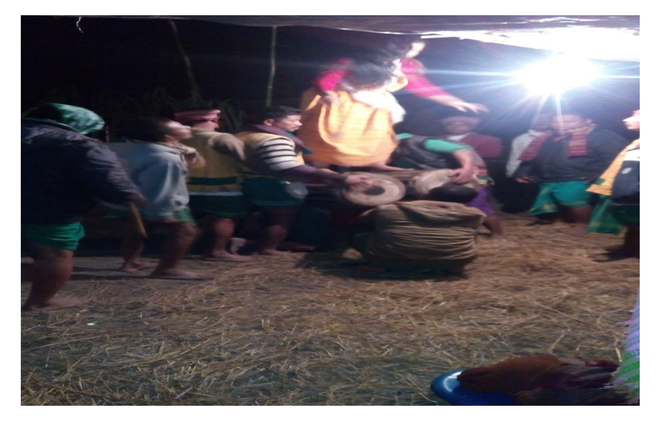
Scene of Khamao Barkhwnai Mwsanai (Dance performed on the Drum)