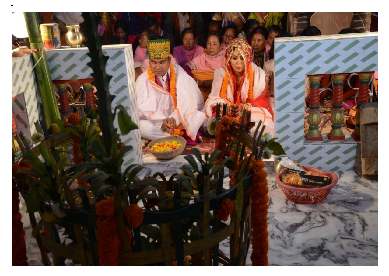
Scene of Modified Bibar Bathwu Marriage with prayer song