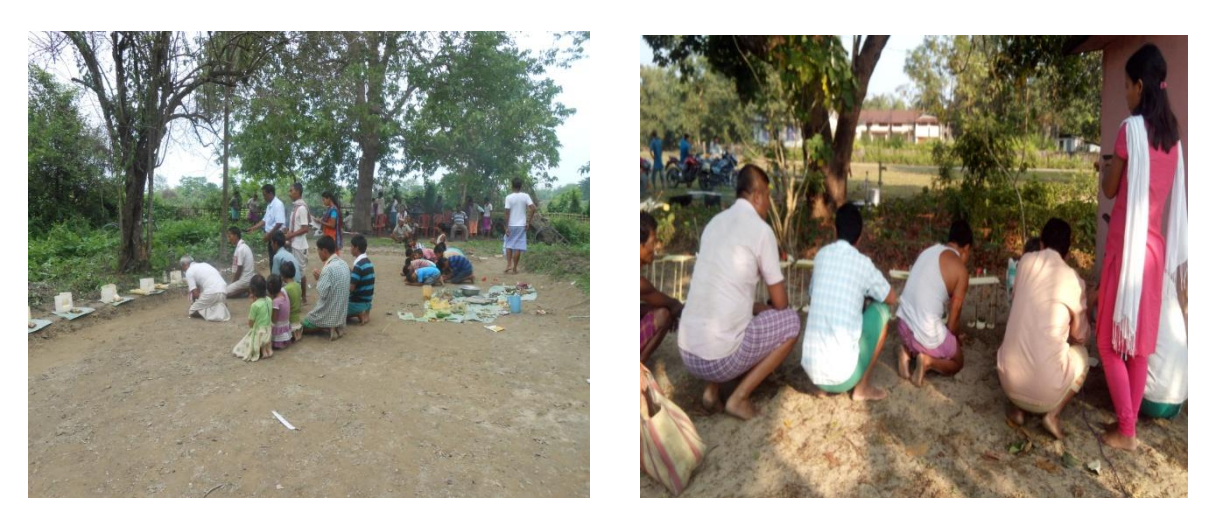
Scene of Ritualistic worship 'Garza' (Worship to village deities)