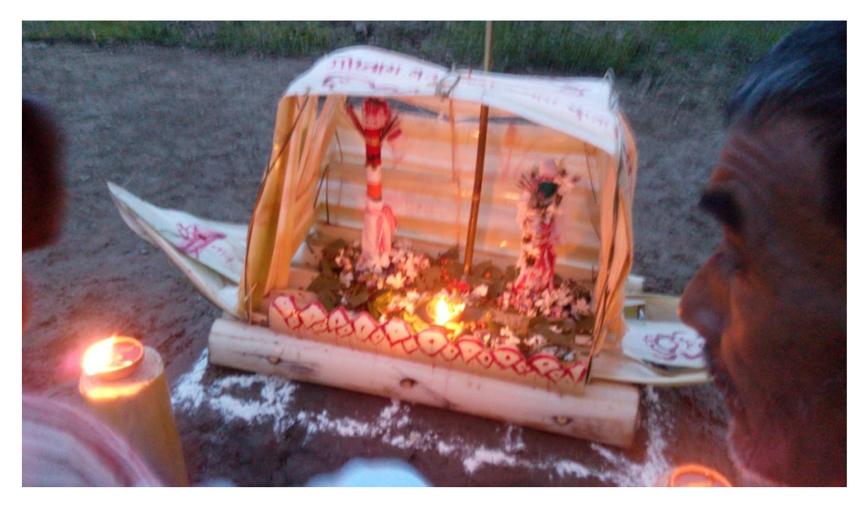
Scene of Ritualistic worship 'Phuthuli Haba' (Doll Marriage)