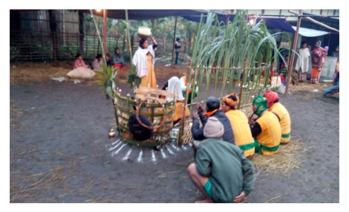
Scene of Mainao Borainai Mwsanai (Propitiatory dance of Mainao God)