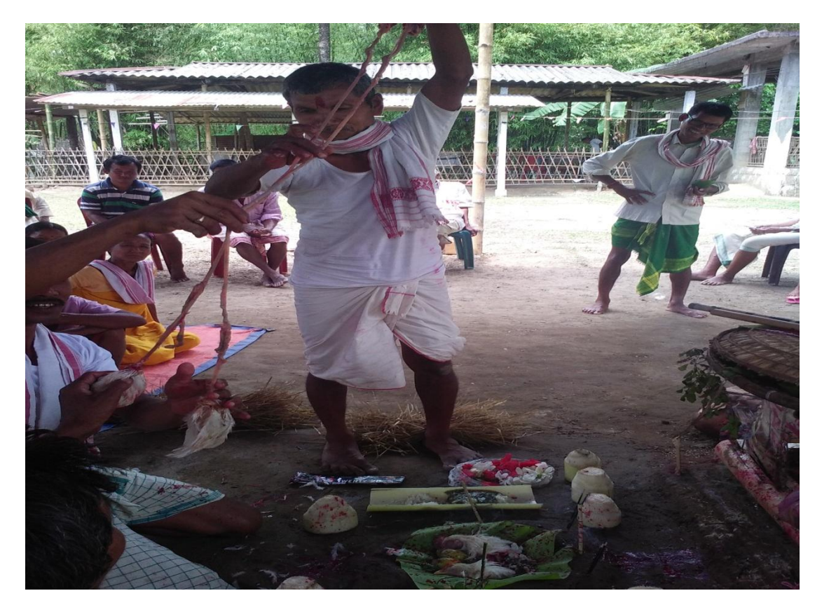
Daomasar (Dao) ni Bibukhwu suna nainai (The intestines of Daomasar were taken out and its being measure of its length) at Phuthuli Haba