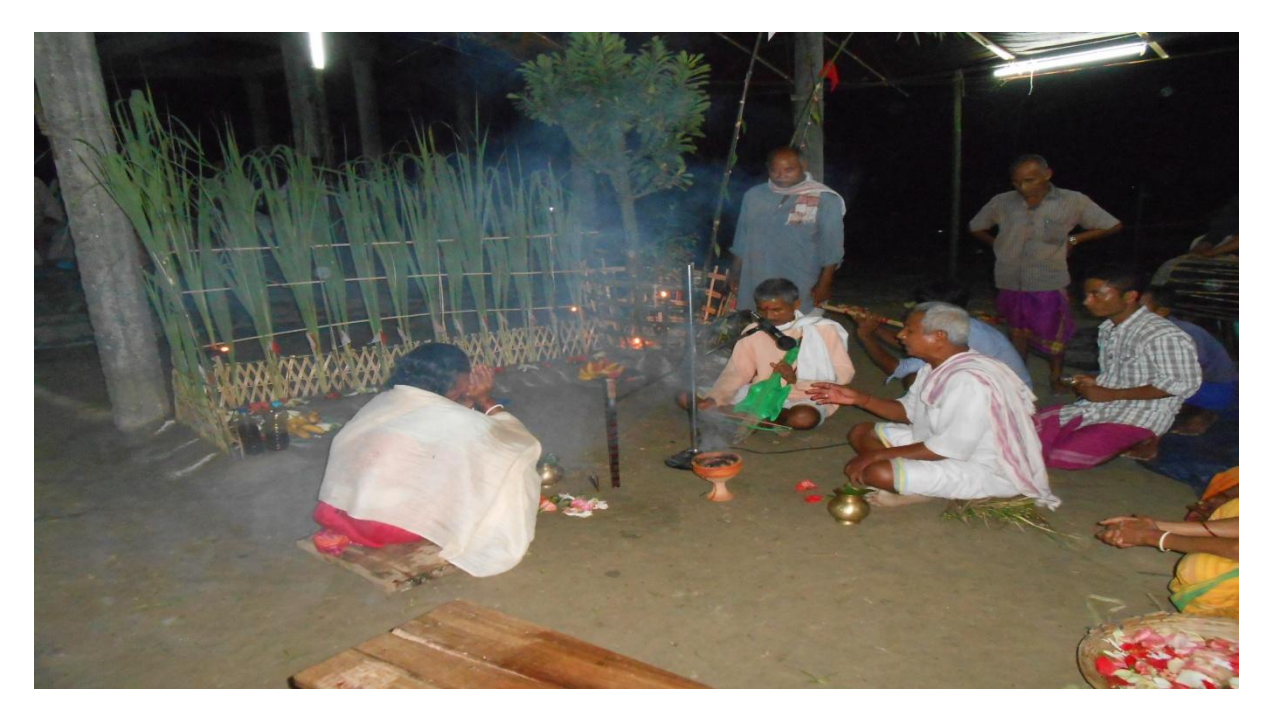
Scene of Ritualistic worship 'Kherai'