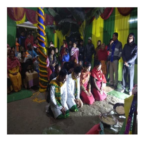
Scene of Hathasuni Haba (Bodo oldest traditional marriage)