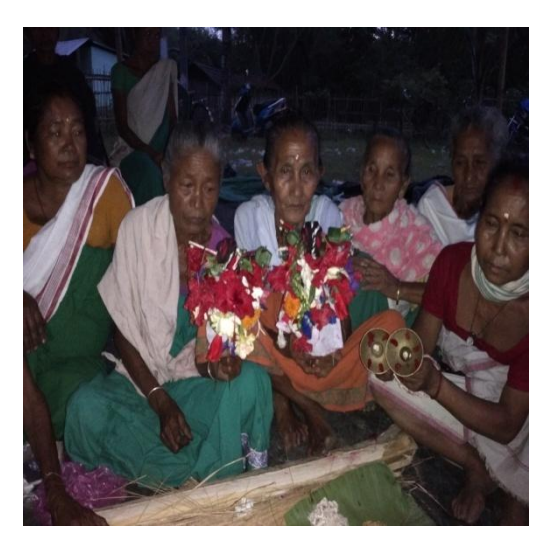
Preparation Doll for Phuthuli Haba