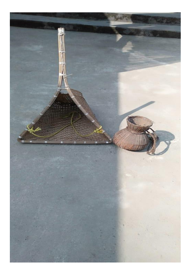
Jekhai, Khobai (fishing trap & taking fish utensil made with bamboo)

Ual, Gaihen (wooden rice husking utensil)