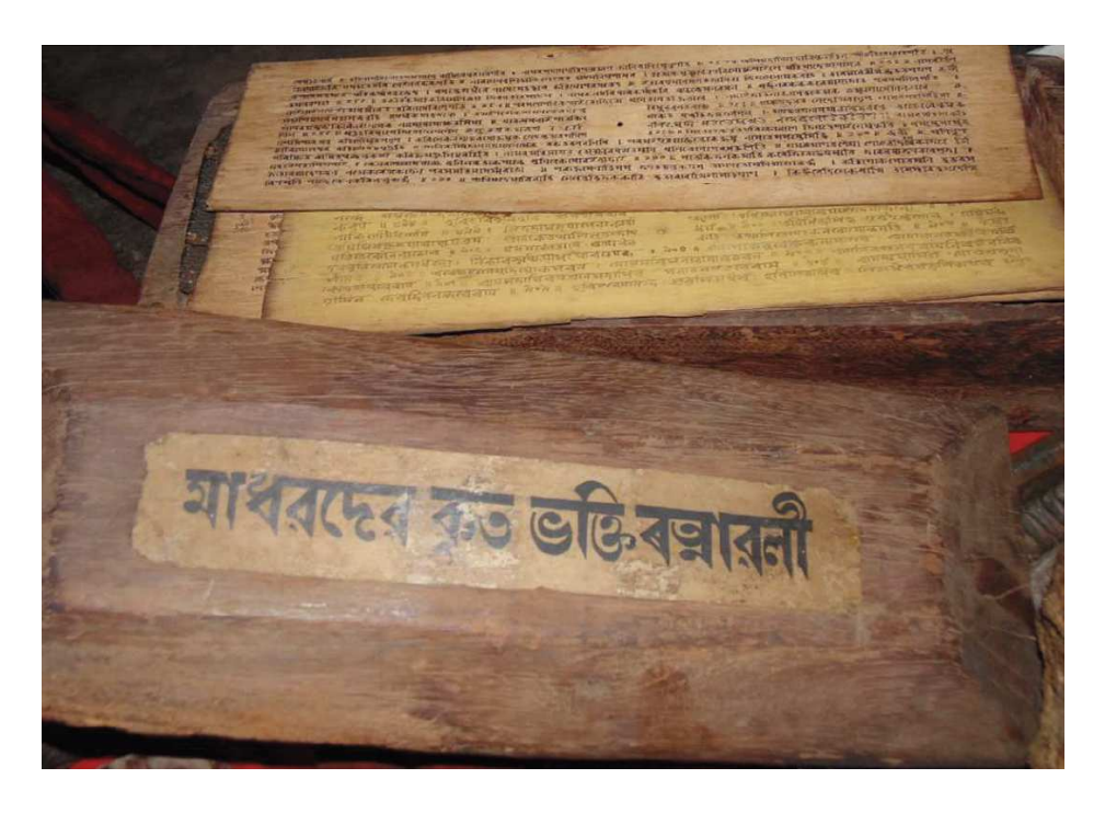
Sanchipat (old manuscript) written by Guru Sankardeva and Madhabdeva which are still preserved at Bishnupur Satra