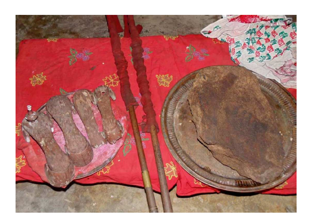
Paduka (wooden slipper) and Padasila (footprint) preserved at Bishnupur Satra