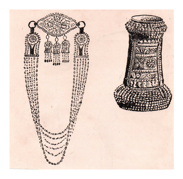
Photo of 'Chandrahar' and 'Muthakharu' (ornaments used by the women of Bijni Raj Estate)