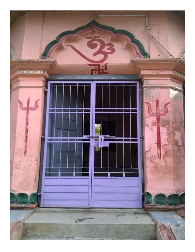
PLATE - IV

Present view of Sengkal Mahakal Temple established by the Bijni Rajas