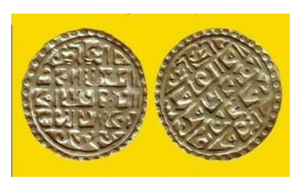
Photo of Narayanee Tanka (Money which was in circulation in the Bijni Raj Estate during early part of Bijni Dynasty)