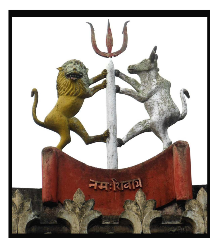
Royal emblem of Bijni Raj Dynasty