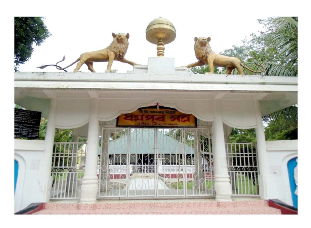
Main Entrance of Dharmapur Satra, Abhayapuri