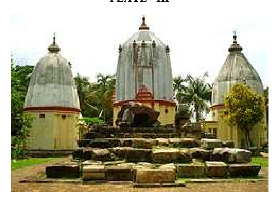
PLATE - III

Ruins of Lalmati Ganesh Temple where Bijni Rajas granted Devottar land