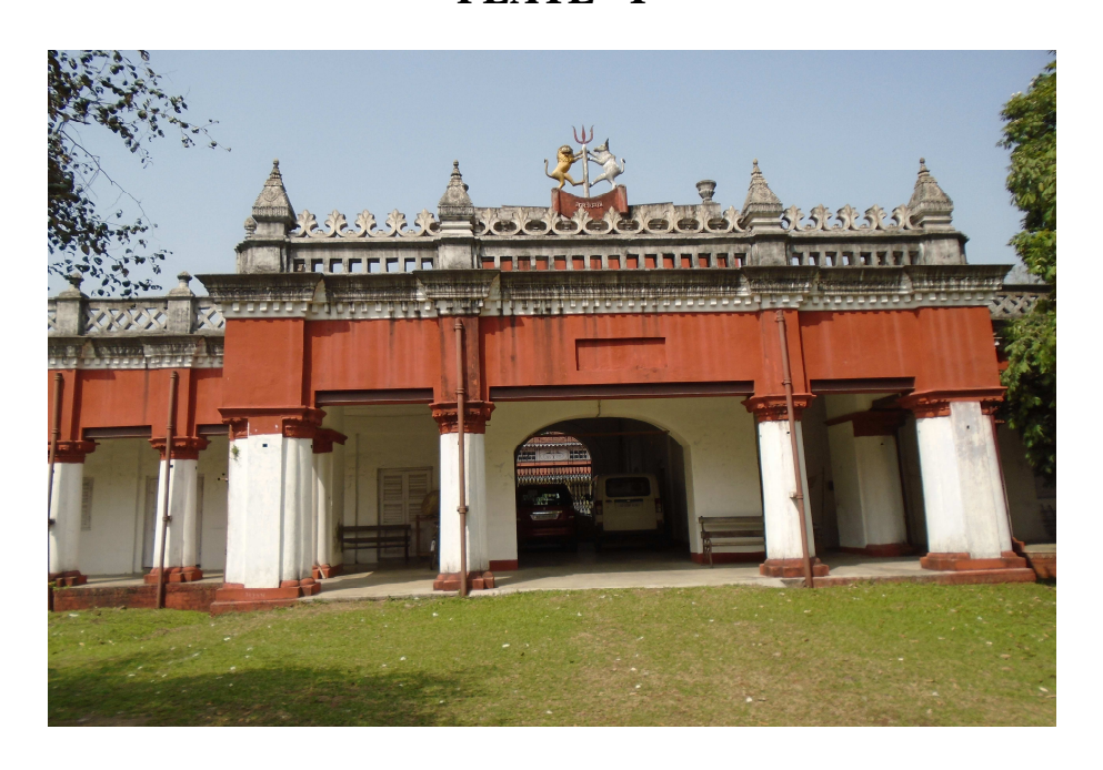
Main entrance of Bijni Raj Palace