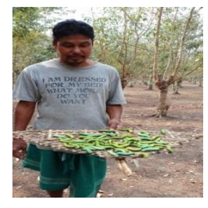
135. A Bodo man with triangular netted woven bamboo tray with bamboo handles for picking and transferring empou (insect)