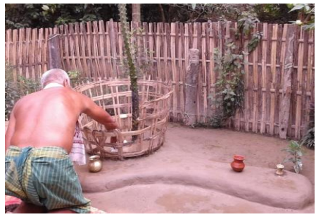
159 . Bathou priest praying in a Bathou Altar, bronze lotha (pot), earthen lotha (pot) and earthen lamp.