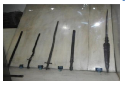
10. Defensive Tools: Thungri (Swords)