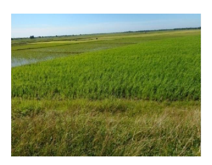
56. Mai dubli (paddy field)