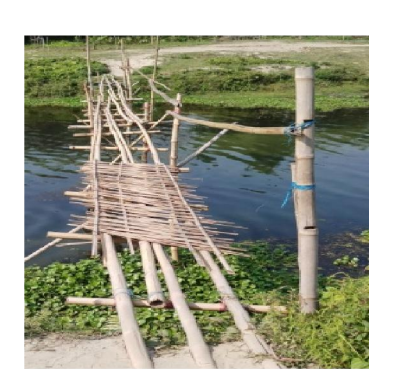
193. Traditional bridge made of woven bamboo sticks and poles.