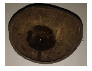
50. Agricultural, domestic, social and cultural tool: Nareal Kolta (coconut cover)