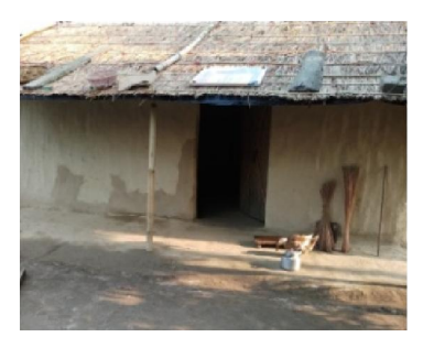
183 . Bodo Traditional House