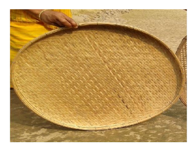
39 . Agricultural, domestic, social and cultural tools: Songrai (Winnower)