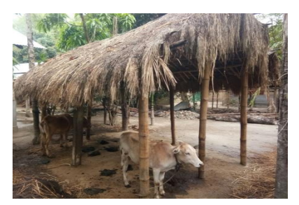
180 . Goli no (Cow shed)