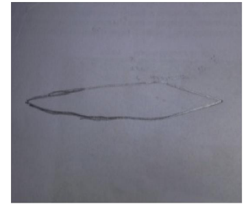
23. Hunting and Defensive tool: Dagger