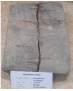
82. Domestic, Social & Cultural tool: Gambari Khamflai (low stool made of gambari wood)