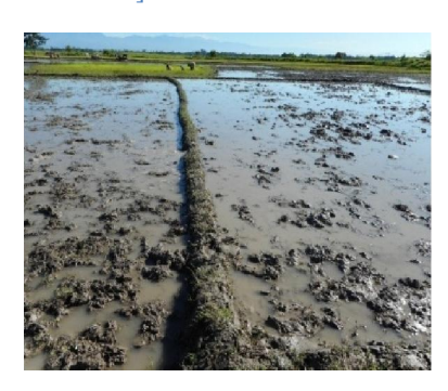
53. Ali (Earthen embankment)