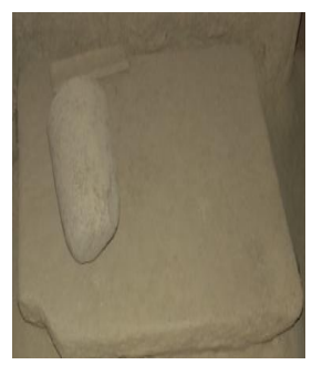
81. Domestic, Social and Cultural tool: Sil-pata (stone grinder)