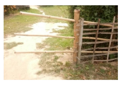
18. Open hankla (traditional gate for protection and defense.