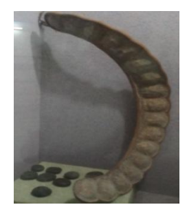
173. Instrument for playing traditional Ghila gelenay-Ghila (Seed of creeping plant)