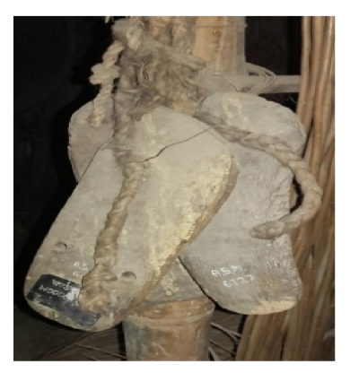
102. Domestic, social and cultural tool- Pwita (Wooden slipper with strips) (Courtesy-Assam State Museum, Guwahati)