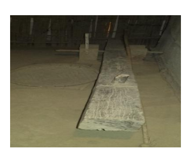
48. Agricultural, domestic, social and cultural tool: Dingkhi (pounder)