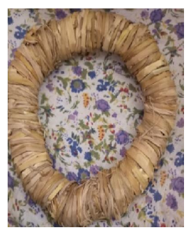
90. Domestic tool: Sindhay (Ring made of straw)