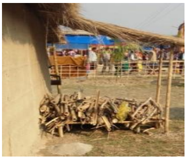
190. Bon (fire wood) dwingra (storage).