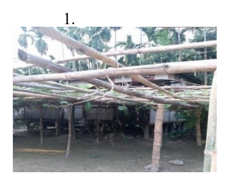
186. Chang bangle (raised platform) and janla (post and fencing of bamboo poles)