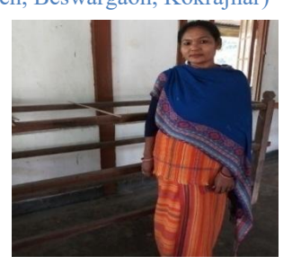
141. Sericultural tool- Wooden rake for hanging female moths.