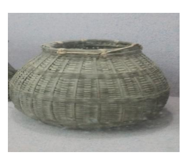
42. Agricultural Tool: Khasa (grain storage)