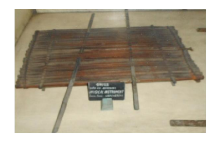
130. Social and cultural instrument- Jangengra (Musical instrument)