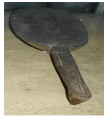
104. Domestic, social and culture tool- Hatha (Large wooden plate or ladle)