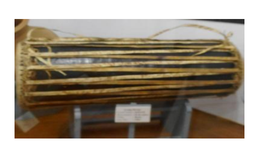
124. Social and cultural instrument- Kham (Drum)