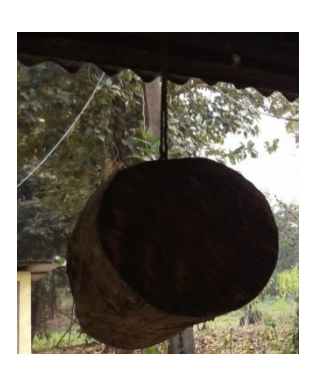
114. Gondrai (A piece of wooden log)