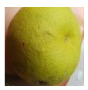
174. Material for playing football Zumbra phithay (Big kind of citrus fruit)