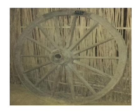
51 . Cart wheel made of wood