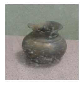
162 . Social and cultural tool- Lotha (Bronze pot)