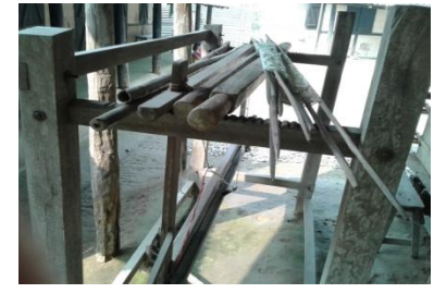
142. Weaving loom, saal- gandwi (wrap and cloth roller), tath (Slay), Gonsha (bamboo stick), Bodangi (bamboo pole), Gorkha (lever), Ban gwja (tool for hanging tath ) and Saal-khuntha (wooden Posts).