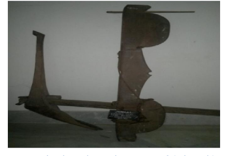
24 . Agricultural Tools: Nangal (Plough) and Jungal (Yoke)