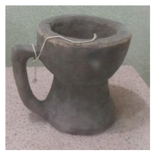
83. Domestic, Social and Cultural Tool: Thophsi (wooden grinder without pestle)