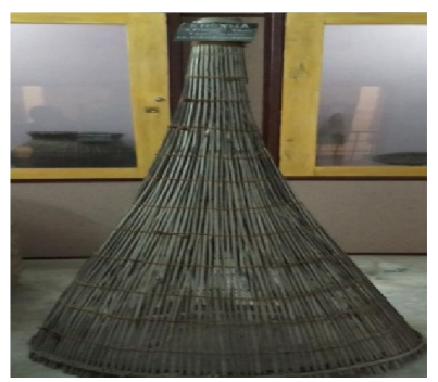
64. Fishing tool: Patha (Fish trap)