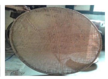
38. Sandanga (sieve): Tools used for agriculture, domestic, social and cultural.