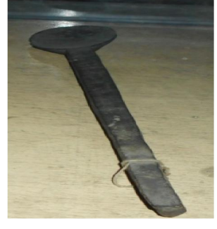
106. Domestic, social and culture tool- Khorsli (Wooden ladle)