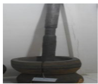
44. Agricultural, domestic, social and cultural Tools: Ural (mortar) and Gaihen (pestle)