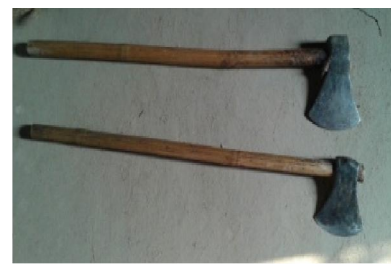
28. Defensive, hunting, agricultural, domestic, building houses and communication networks tool: Ruwa (Axe)