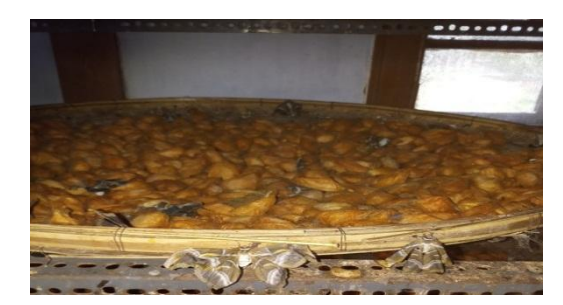
134. Sericultural tools- Sandanga, eri pitab and sikri (Bamboo woven platform with cocoon and butterfly)