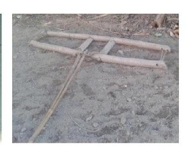
29. Agricultural tool: Mwi (Harrow) with Dangur (split bamboo at both ends)