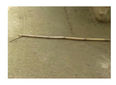
36. Agricultural Tool: Hukhen (grain separator) used to separate thrashed materials and the grains.