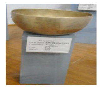
49. Agricultural, domestic, social and cultural tool: Kurai gubai (bowl made of bronze)