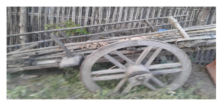
52. Mosow Gari (Bullock Cart) used for agriculture, transportation, social and cultural purposes.