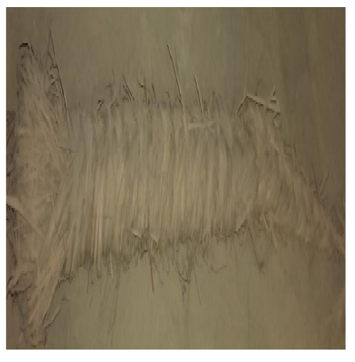
103. Domestic, social and cultural tool- Jegab buntha (Twisted bundle of dry straw)