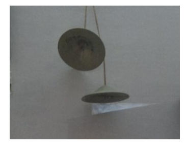
127. Social and cultural instrument- Modern jotha (Cymbal)