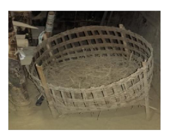
16. A round fencing of split bamboo sticks to store dry to feed straw cows courtesy-Assam State Museum, Guwahati]