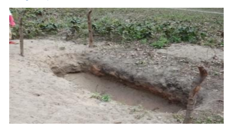
137. Place for arrangement for burning worms.