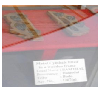
129. Social and cultural instrument- Jabkring (Rattle)