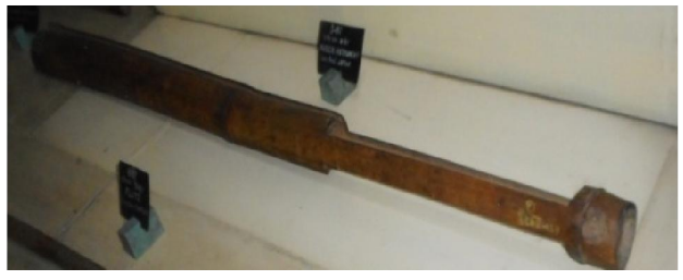
132. Social and cultural instrument- Thorkha (Clapper)