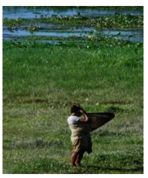
78. Bodo woman fishing with Zekhai (Fishing trap) and Khobai (Fish storage)