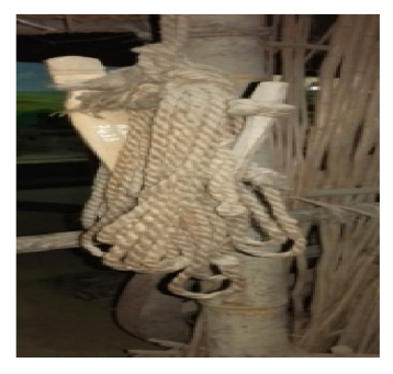
89. Patw durung with thangwn (Jute rope with small bamboo piece with one pointed end for tying cow