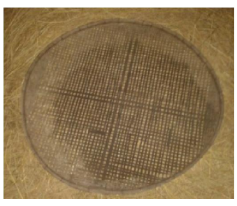
40. Agricultural, domestic, social and cultural tool: Sandri (smaller kind of sieve)