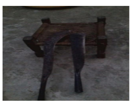
7. Sikha gobda (Big Knives) used in defensive, hunting, agriculture, domestic, house building, communication & network building.