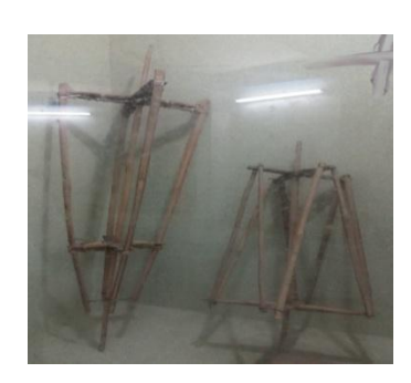
153. Danganatha and Sorkhi (Spinning tools)