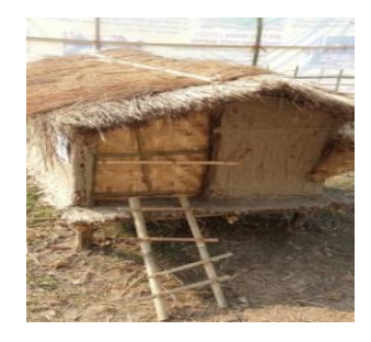
188. Dao gogra (chicken coop) are built in bwsang form having only one entrance without any windows, one and half to two feet high above the level of ground.