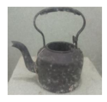
110. Domestic, social and cultural tool- Iron Kettle