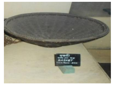
43. Agricultural, domestic, social and cultural tool: Don (Bamboo pan or basket) [courtesy- Assam State Museum, Guwahati]