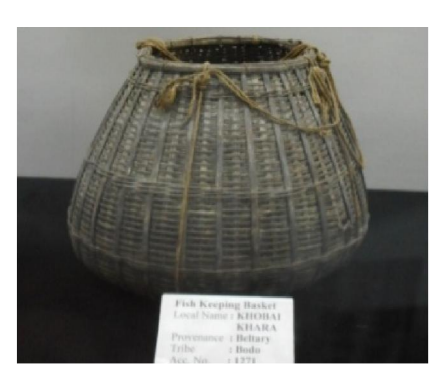
65. Fishing tool: Khobai Khara (Fish storagr)