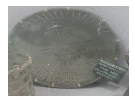
109. Domestic, social and cultural tool- Maigong khada (Vegetable basket also used as basket for picking cow dung)