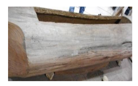
194. Traditional boat made out of Sumli dongpang (Sumli tree)