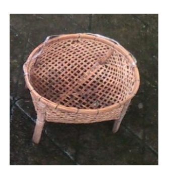
108. Domestic, Social and Cultural Tool: Abwijamgi (Bamboo basket with four legs)