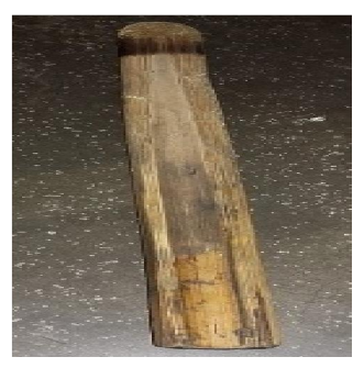
107. Domestic, social and cultural tool- Kadau (Wooden ladle)