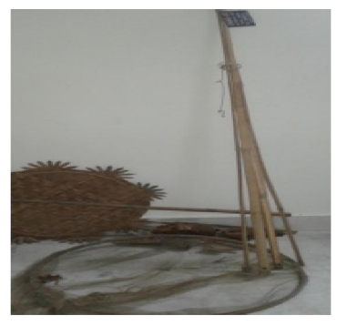
76. Fishing tool: Khakhi (Fishing trap)