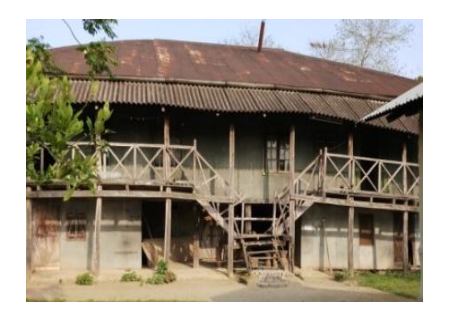
185. Bangla (House with ground floor and first floor)