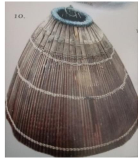
80. Fishing tool-Zulakha (Fishing trap)