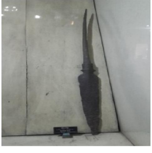
8. Hunting and Defensive Tool: Jong (Spear)