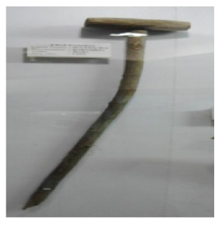
22. Hunting and Defensive Tool: Hathura (Hammer)