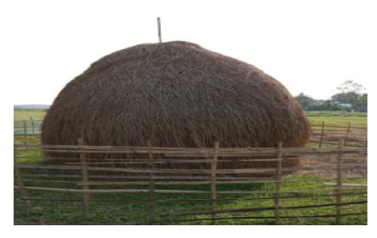
17. Maihung (a heap of dry straw for feeding cows) and bamboo fencing to protect the straw from stray cattle.