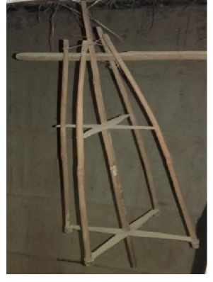
154. Natha (Spindle)