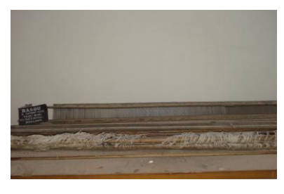
147 . Rasw (Reed)