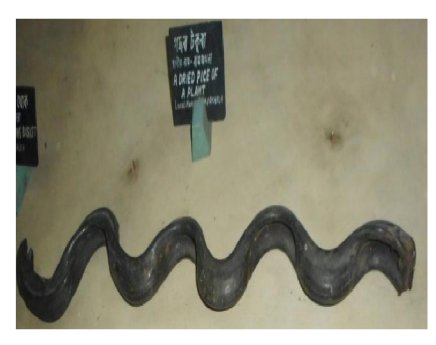
105. Domestic tool- Ramjangkla (A broken piece of wooden ladder)