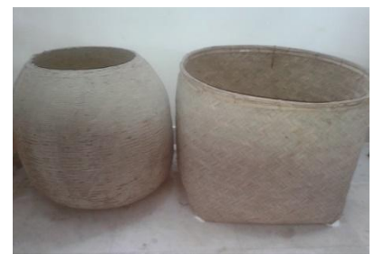
41. Agricultural tool: Duli (grain storage)