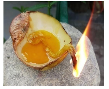
161. Social and cultural tool-Traditional gasa (lamp) made out of thaigir bikhong (a kind of fruit)