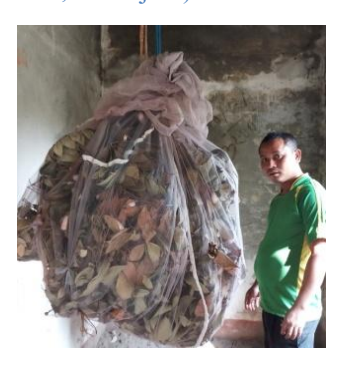
136. Eri empou (Eri insect) put under branches of mujlior som leaves and placed in nylon net and hanged from roof of a house with a rope for forming cocoons. .