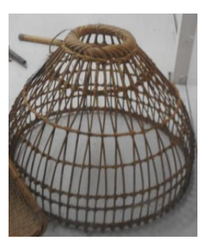
79 . Fishing and social cultural tool: Polo (Fishing trap)