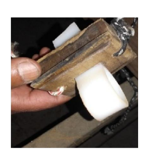
155. Weaving tool-Picker