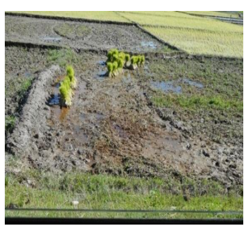
55 . Khotia phunai (uprooted seedling) ready for plantation.