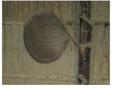
85. Domestic, Social and Cultural tool: Gisib (Hand fan)