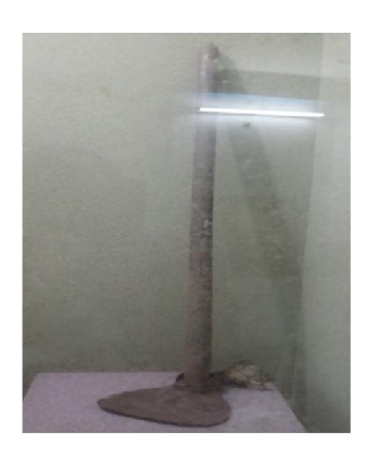
30. Agricultural, domestic, social cultural, building houses and communication network tool: Khodal (digging hoe)