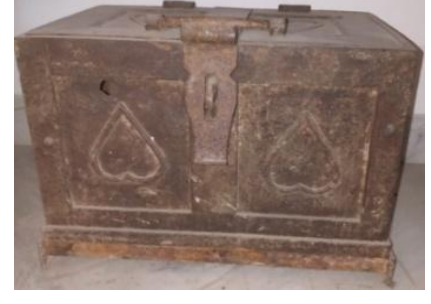
84. Domestic tool: Lohani sanduk (Box made of iron)