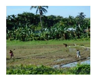
58. Constructing ali (embankment)