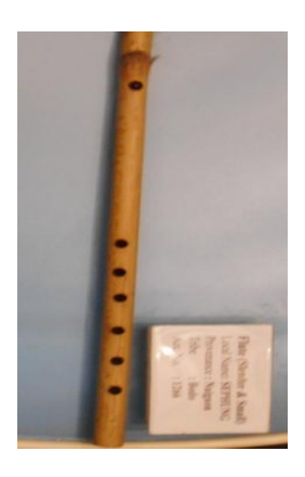
125. Social and Cultural instrument- Siphung (Flute)