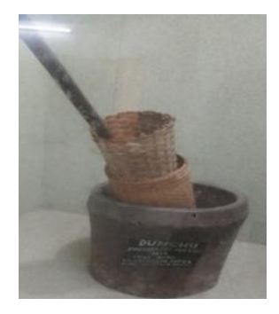
116. Dungsu (Wooden article) with janta for preparing jou