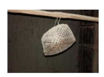
157. Nw Dangra (Bamboo made small basket)