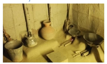
96. Domestic, social and cultural tools- Iron bucket, Silver kettle, Earthen pot, Iron pan, guji (sharp metal object with wooden handle) and hearth.