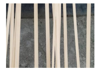
177. Social and cultural tool- Oua themal (Bamboo strip)