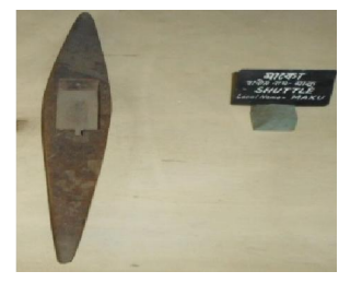
151. Maku (Shuttle)