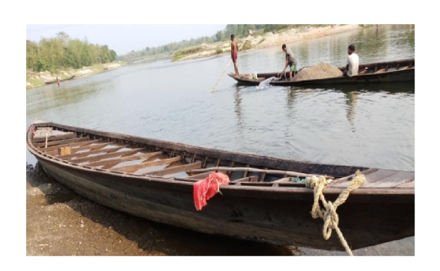
195. Wooden boat