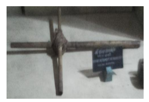
91. Domestic tool: Kerepa (Bamboo instrument for making rope)