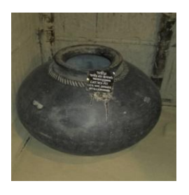
92. Domestic, Social and Cultural Tool: Haani Dwihu (Earthen pot)