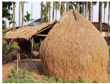
181. Maihung (heave of dry straw for feeding cows)