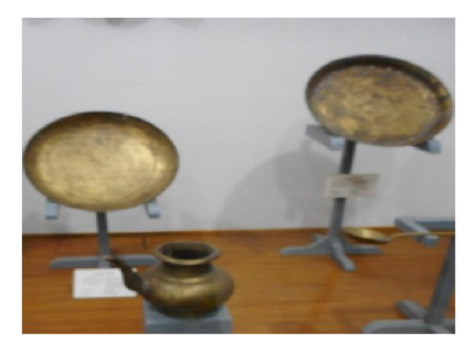
111. Domestic, social and cultural tool- Bronze thwrsi (plate) and lotha (Kind of bowl with small mouth)