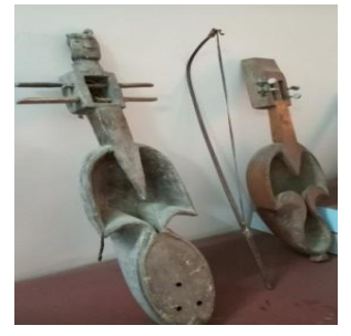
126. Social and cultural instrument- Serja (A kind of violin)