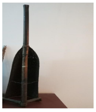
32. Chili (water lifter) used in agriculture and fishing purposes.