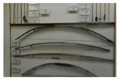
11. Hunting, Defensive and Fishing Tool: Jilit (Bows)