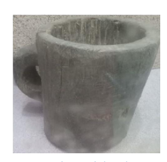
112. Domestic, social and cultural tool- Dongpangni gelas (Wooden glass)