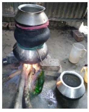
123. Social and cultural tools- Silver pot with shorter neck, mwkhra koro , and bigger silver pot with pipe (Modern method of preparing distilled liquor with pipe)