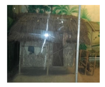
182. Bodo traditional house