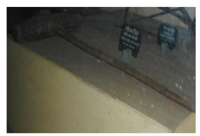
27. Agricultural tool: Dangan (Hammer like)