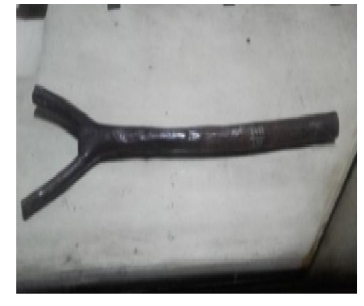
9. Lauthi (Stick) used for Hunting and Defensive purposes