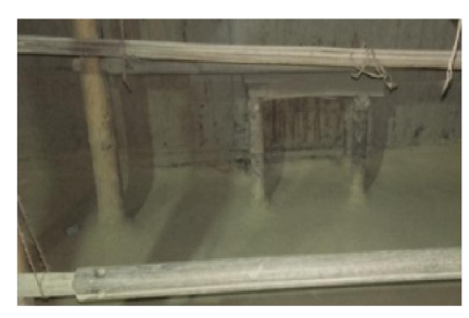
144. Bwisang (Raised platform for the weaver to sit and weave)