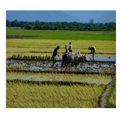
54. Hal maunai (ploughing)