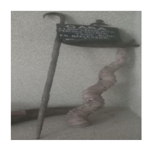
158. Religious tool- Gasa (Lamp stand)