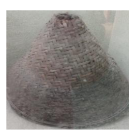
117. Janta (Conical bamboo sieve)