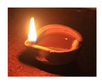
160. Social and cultural tool- Jewari Bathi (Earthen lamp)