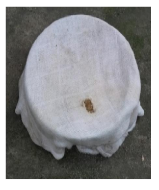
66. Fishing tool: Khurwi Sanai (Fishing with bowl)