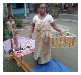
146. Bodo women kundung swngnai (to lead on yarn)