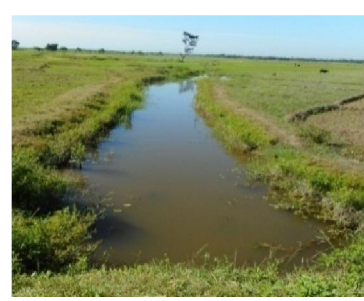
57. Dong (channel)