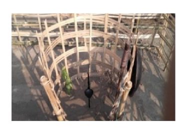
170. Kasa (Lamp stand), Thungri (Sowrd) and Dahal (Shield)