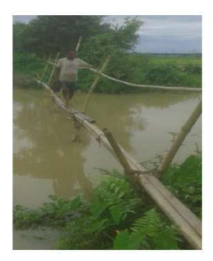
192. Traditional bridge made out of bamboo poles and