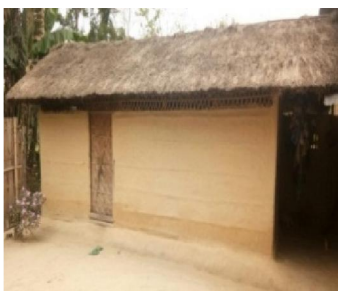
184. Bodo Traditional House