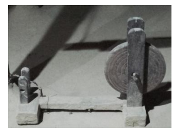
149. Jenther (Spinning tool)