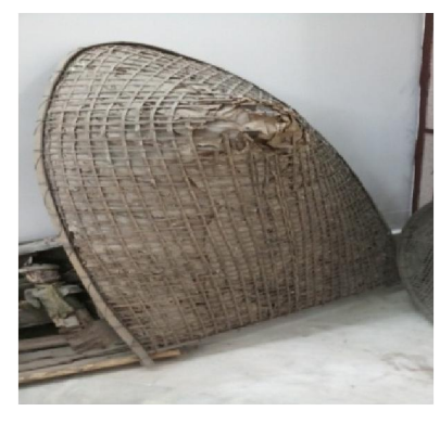
31. Agricultural and domestic tool: Khopri (wicker hat)