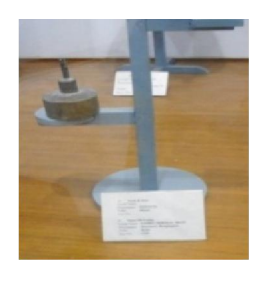
94. Domestic Tool: Sakhi on sakhi stand (open lamp on lamp stand)