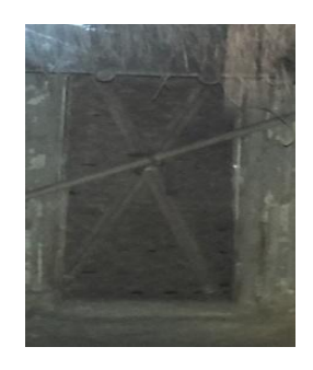
187. Door made of woven bamboo mat and lock made of oua (bamboo pole) called ' pala thokon '