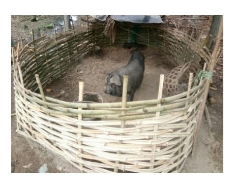
189. Oma gondra (Pigsty)