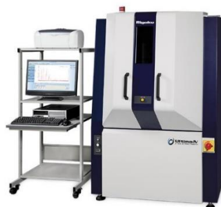
Figure 2.4. X-ray diffractometer (Rigaku Ultima IV).

The X-ray diffraction (XRD) pattern of the CS/KAO biocomposite films was recorded using an X-ray diffractometer (Rigaku Ultima IV) at room temperature. Cu K\alpha radiation ( \lambda = 1.5418 \text{ \AA} ) was emitted from a broad focus Cu tube operated at 40 kV and 40 mA for sample measurement. Other samples were analyzed using a Bruker AXS X-ray diffractometer (model D8 Focus, Germany) with Cu- K\alpha radiation (wavelength \lambda = 0.154 \text{ nm} ). The instrument operated at 30 kV and 30 mA, with a scanning rate of 0.05 degrees per second, covering a 2\theta range from 10^\circ to 70^\circ . The step size for the investigation was set at 0.1 ( 2\theta ).