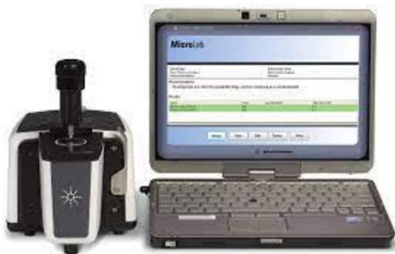
Figure 2.1. Agilent Cary 630 FT-IR spectrometer.

(Source: https://www.researchgate.net/figure/Agilent-Cary-630-FTIR-Spectrometer-equipped-with-MicroLab-application_fig1_364566684 )