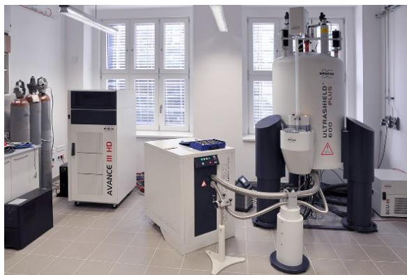
Figure 2.3. 600 MHz NMR spectrometer.

The ^1\text{D} nuclear magnetic resonance (NMR) spectra of CS and MCS were recorded on 600 MHz NMR spectrometer (Advance III, Bruker, Biospin, Switzerland) operating at 150.154 MHz for ^{13}\text{C} frequencies with Bruker's 3.2 mm Efree probe.