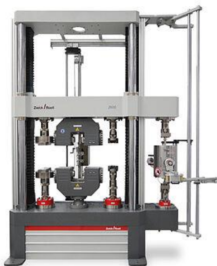
Figure 2.6. Zwick/Roell UTM.

Additionally, the texture analyzer (TA-HDPlus, Stable Microsystems, UK) was utilized to determine the tensile properties of some biocomposite films. Thin strips, 10 mm in width, were cut from each biocomposite film to assess their textural characteristics. These strips were secured in the grips of the testing machine with an initial gap of 20 mm between the grips. The tests were carried out with specific parameters: a pre-test speed of 2 \text{ mm s}^{-1} , a test speed of 3 \text{ mm s}^{-1} , a post-test speed of 10 \text{ mm s}^{-1} , a distance of 75 mm, and a trigger force of 10 g. The testing probe was attached to a 5 kg load cell. All measurements were conducted in triplicate, and the average values were reported.