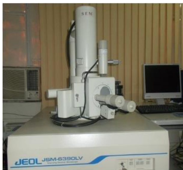
Figure 2.5. Scanning electron microscope.

Scanning electron microscopy (SEM) images of CS and MCS were obtained using an analytical scanning electron microscope (JSM 6390LV, JEOL, Japan) operating at an accelerating voltage of 20 kV. The SEM images of CS/KAO biocomposite films were captured by an analytical scanning electron microscope (Zeiss SIGMA 300) operated at an accelerating voltage of 5.00 kV. Additionally, SEM images of CS/BNTN and CS/Si biocomposite films were taken using an analytical scanning electron microscope (JSM-7610F) with an operating accelerating voltage of 5.00 kV. To prepare the samples, all biocomposite films were cut into small pieces and mounted onto the SEM holder using double glue tape. Subsequently, a mixture of palladium (Pd) and gold (Au) was plasma-sputtered over the surface of the samples.