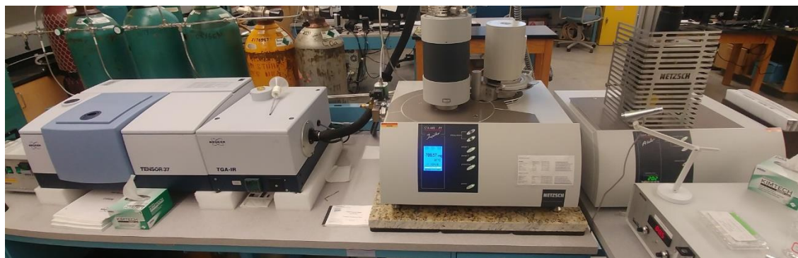
Figure 2.7. Instrument for TGA and DSC analyses.

Differential scanning calorimetry (DSC) analysis of CS/KAO biocomposite films ( \sim 6\text{ mg} ) was conducted using a Netzch instrument (Model: STA449F3A000). The samples were heated from 20\text{ }^{\circ}\text{C} to 600\text{ }^{\circ}\text{C} at a rate of 10\text{ }^{\circ}\text{C min}^{-1} under an argon atmosphere. DSC analysis for other samples ( \sim 6\text{ mg} ) was performed using a NETZSCH DSC 214 Polyma (DSC21400A-0438-L). These samples underwent heating, starting from 30\text{ }^{\circ}\text{C} and reaching 400\text{ }^{\circ}\text{C} , at a controlled heating rate of 10\text{ }^{\circ}\text{C min}^{-1} . The DSC analysis was carried out under a nitrogen atmosphere with a constant flow rate of 20\text{ mL min}^{-1} .