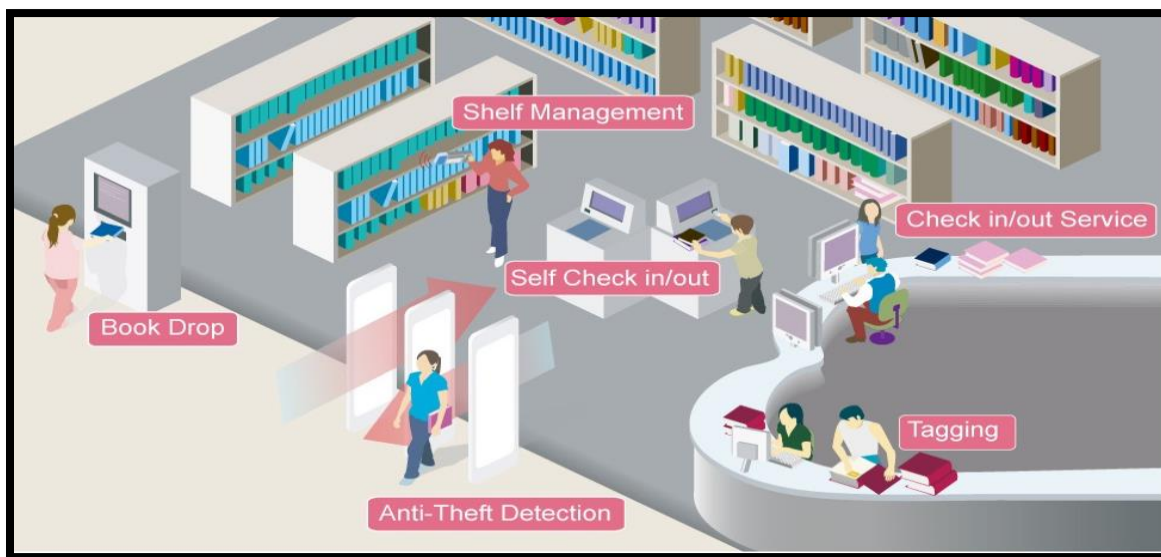
Figure. 3. RFID Library Management System